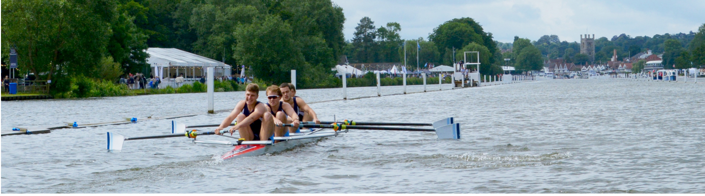
MENS 4+ HRR VS YALE