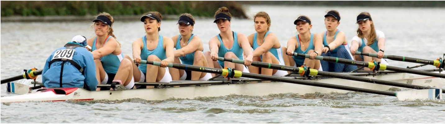
56TH PLACE FINISH WEHRR